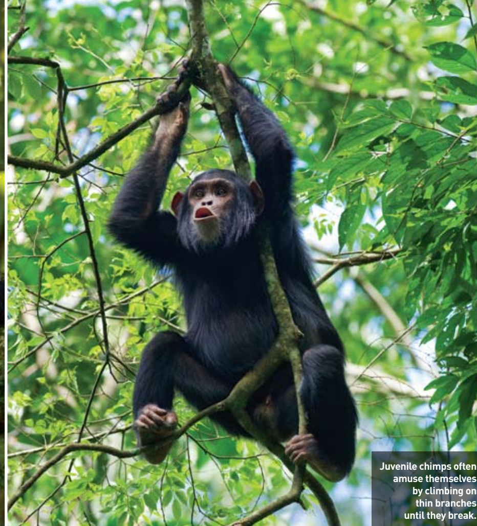
Juvenile chimps often amuse themselves by climbing on thin branches until they break.