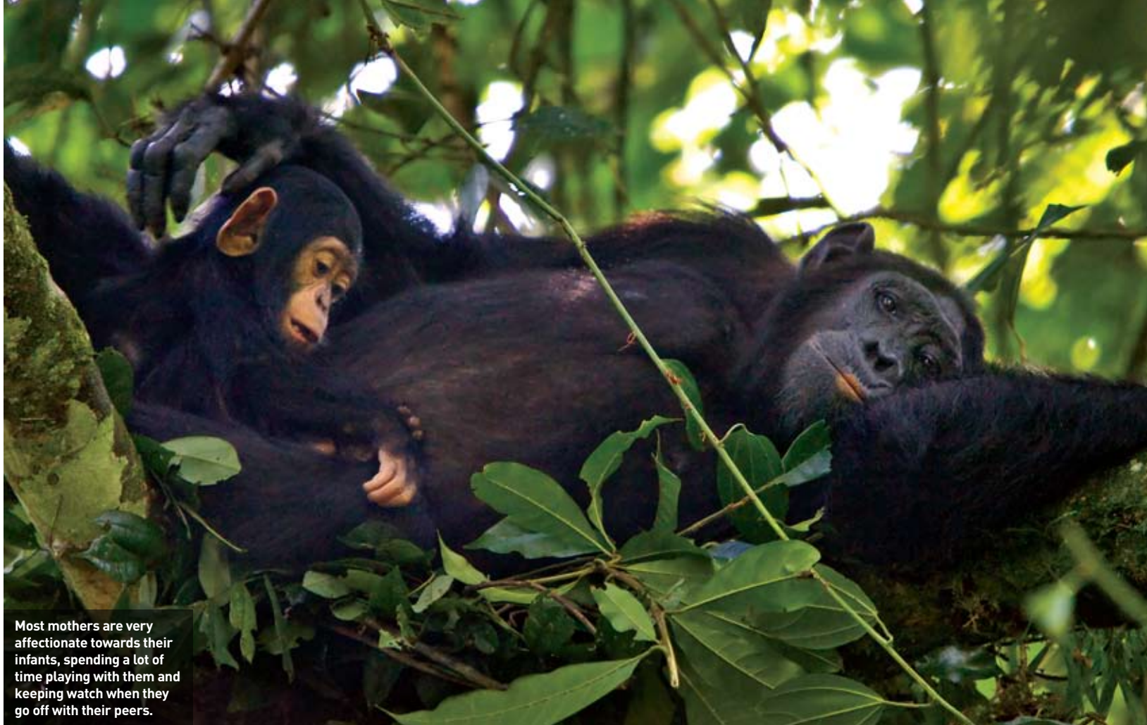
Most mothers are very affectionate towards their infants, spending a lot of time playing with them and keeping watch when they go off with their peers.