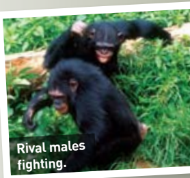
Rival males fighting.

TWO CHIMPS OF THE LOST GORGE, about Ugandan chimps, airs on BBC2 as part of the winter season of Natural World .