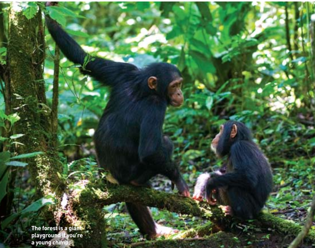
The forest is a giant playground if you're a young chimp.